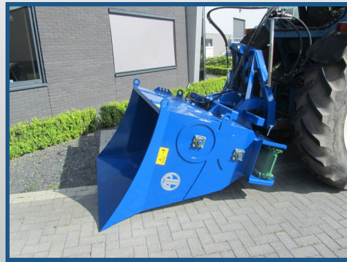
type ASM (rear attachment)

Because the cubicle bedders are equipped with a mounting frame they are suitable for both front and rear attachment. These solid machines are built by us from the beginning to the end, sandblasted and provided with a primer and finished with a high-grade 2-component coating.