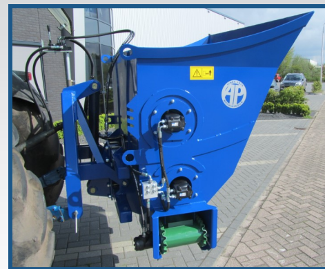
type ASM (rear attachment)