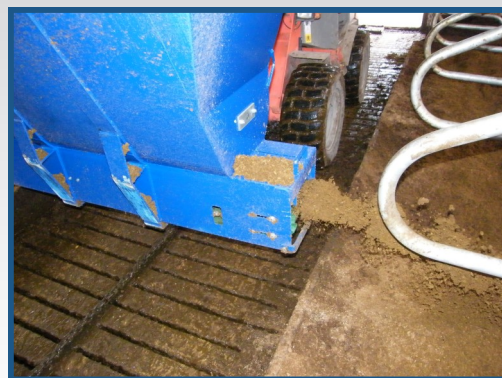
type AS (front attachment)