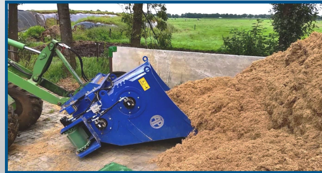
type ASM (front attachment)