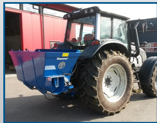
double-sided discharge, rear attachment