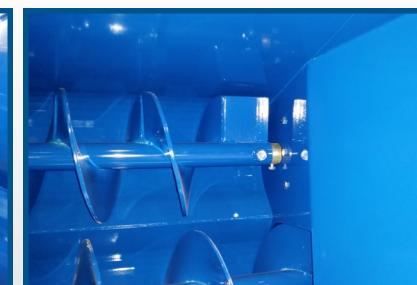
shearbolt overload protection