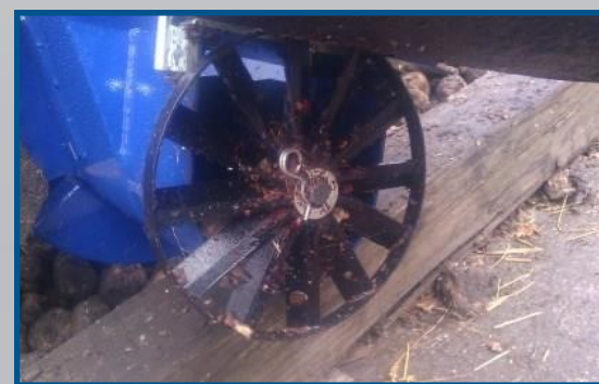
fodder beet cutting device with potato knife (10-bladed)