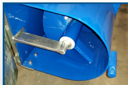
low-maintenance auger suspension