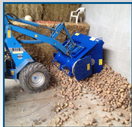
one-sided discharge, equipped with potato cutting device