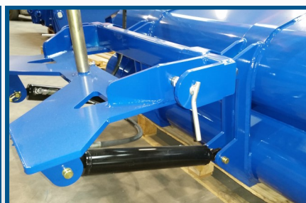
unique 2-points linkage