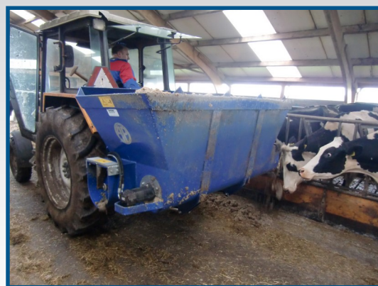
double-sided discharge, rear attachment

On both the VDC- and the VDCE-types the auger suspension is constructed to ensure minimal resistance of the feed during discharging. The hydraulic motor is protected by a shearbolt overload protection. The types for front attachment are delivered with electric-hydraulic control, the types for rear attachment come as standard with a manual control valve.