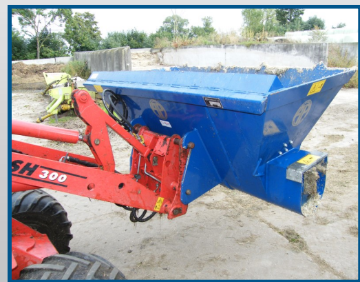
one-sided discharge, front attachment

The range consists of 18 models, all hydraulically driven and suitable for both front and rear attachment. Capacities from 475 to 1875 litres, widths from 1,20 tot 2,53 m. Furthermore there is a wide range of options. In short, for every farmers needs the proper auger bucket.