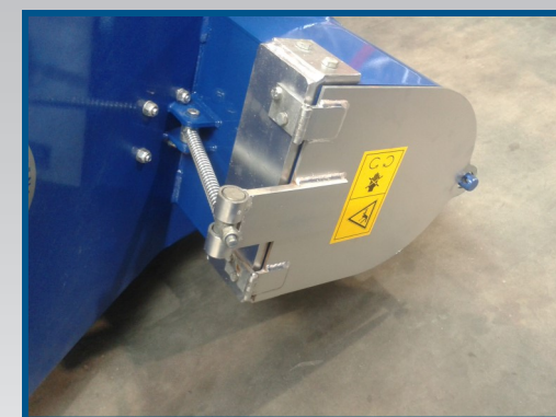
mechanical shut-off valve

The use of shut-off valves increases a safe operation of the AP auger bucket and prevents loss of feed. The mechanical shut-off valve opens by the pressure of the feed during discharging and closes automatically by the spring pressure if the discharging stops.